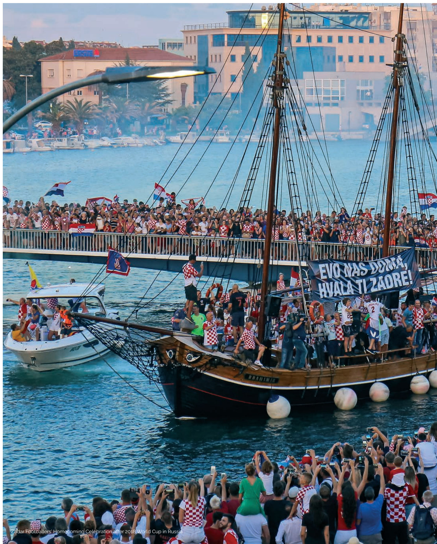
Zadar Footballers' Homecoming Celebration after 2018 World Cup in Russia