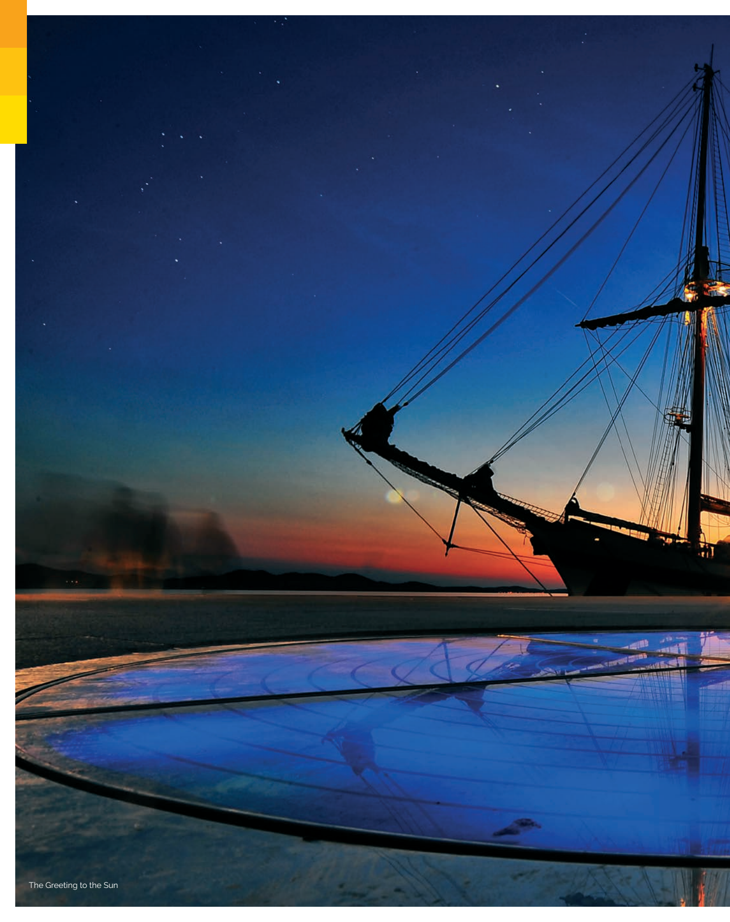
The Greeting to the Sun