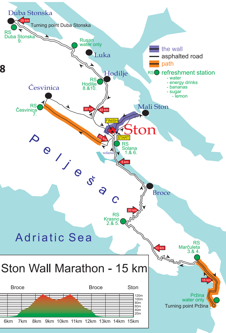
Altitude diagram Ston Wall Marathon - 15 km