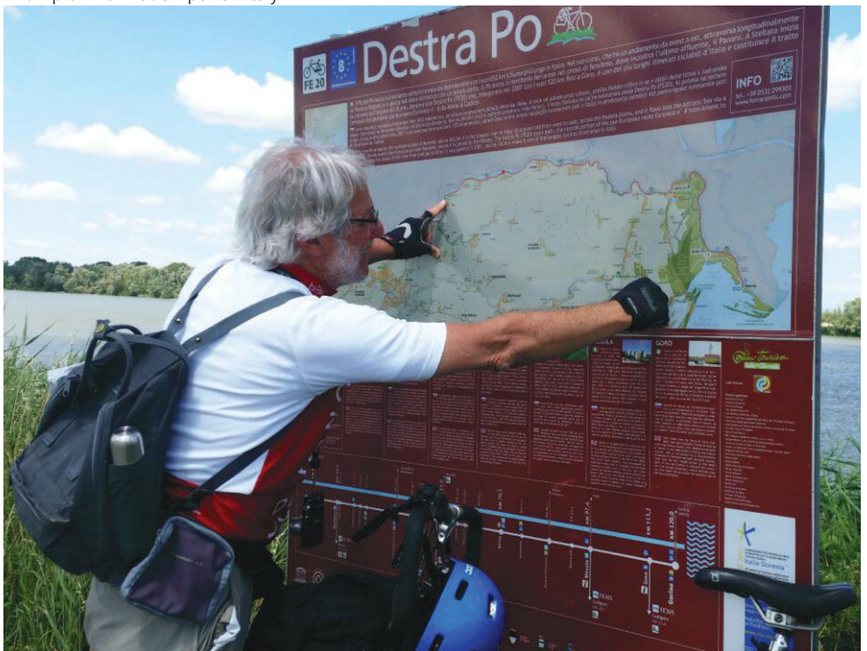
Example information panel: Italy

The following examples show how the graphic features of the EuroVelo 8 – Mediterranean Route can be used to communicate and promote the route.